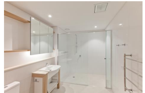
Typical ILU Bathroom