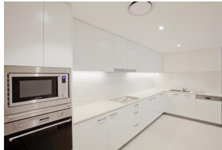
Typical ILU Kitchen

Not long now... Stage 2 is nearly complete!