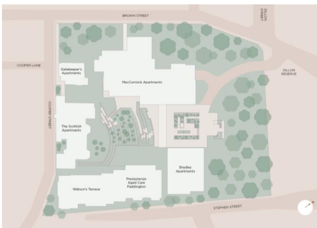
The future Terraces Paddington site

With the Stage 1 and 1A buildings now complete and the final phase of works in full swing, we will continue to publish this newsletter to keep you updated on what is happening on site and provide any other important information you may need to know during the final stage of construction.