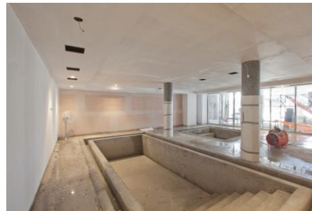
Pool and Spa