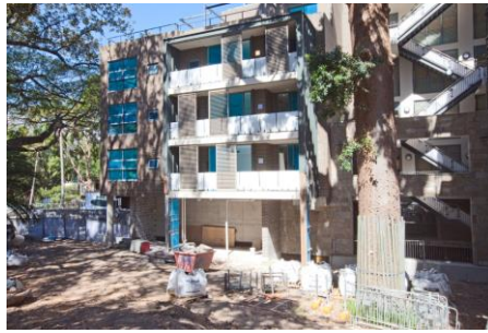
Western elevation of the MacCormick building