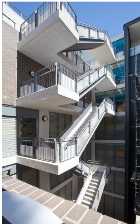
MacCormick Building facade