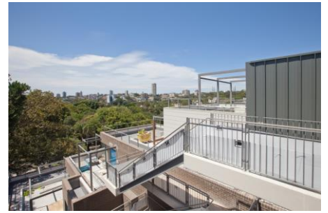
Outlook from Level 8 of the MacCormick building

Not long now... Stage 2 is nearly complete!